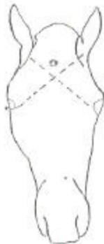
Figure 1. The target area for humane destruction of a horse by shooting just above the intersection of the broken lines.

13.4 The target area and direction of the bullet are shown below: